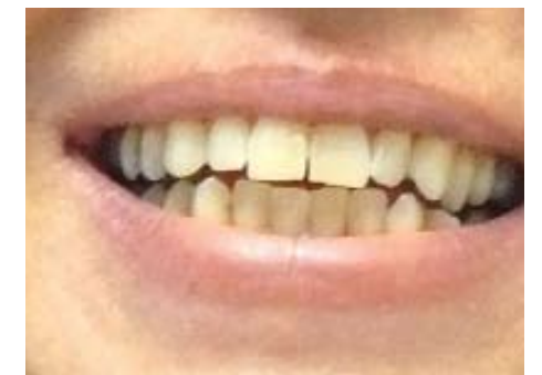
AFTER: Brightened up to a far more acceptable 2.5M2

I'm perfectly happy, though, to lie back and think happy thoughts for an hour – even the strange plastic frame that Donna inserts into my mouth to keep it open wide and protect my lips and gums isn't really a bother.