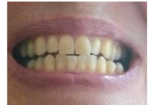
BEFORE: My teeth clock in at an average 4M2